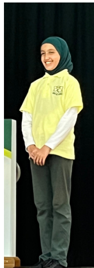
PUBLIC SCHOOL AMBASSADOR