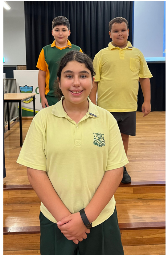
Banksia House Captains & Vice Captains