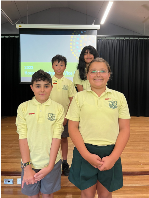
Waratah House Captains & Vice Captains