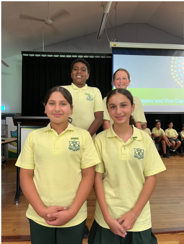
Boronia House Captains & Vice Captains