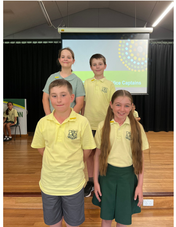
Wattle House Captains & Vice Captains